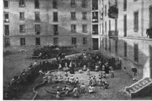
The first Casa dei Bambini, San Lorenzo, 1907