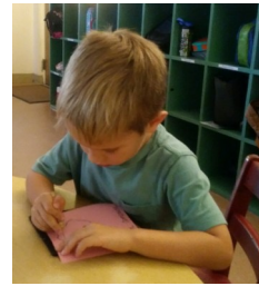
Pricking: South America