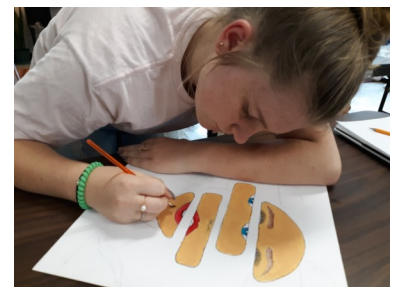
A student working on her surrealistic painting