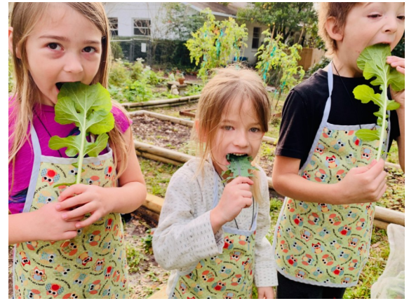
Enjoying so fresh kale!