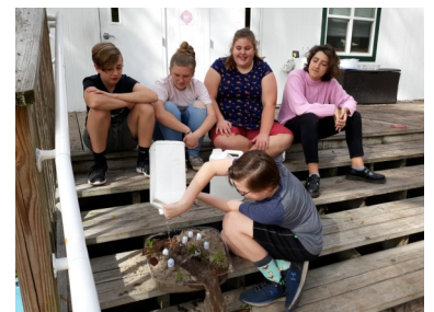
Testing the erosion boxes