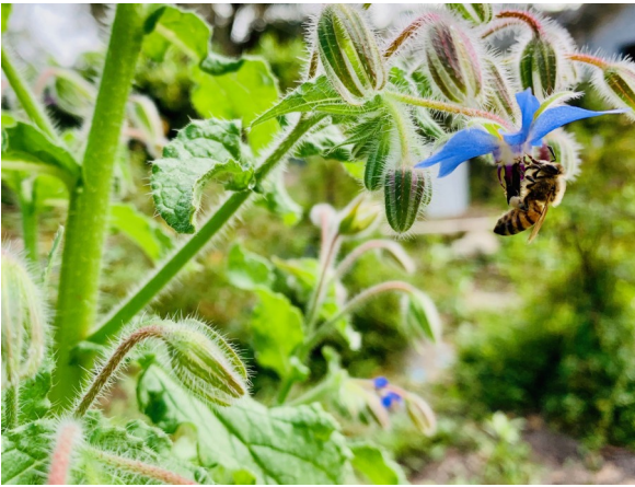
The borage is in bloom, and is hosting a helpful guest.