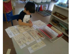
Biology: The Human Body