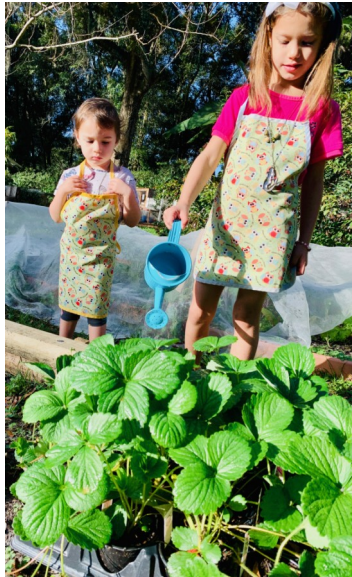
Students helping to care for the new strawberry plants.