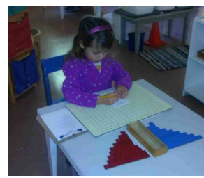
Addition Strip Board

The room is a buzz in the afternoon these days. We welcome those students who transition from napping to staying in the classroom all day. The growth and development happening in the classroom is very exciting!